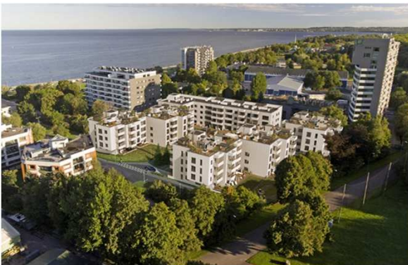
Mariino Residents, Tallinn, Estonia