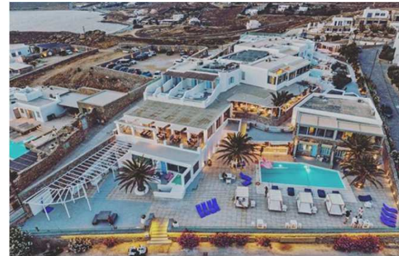
Mykonian Mare Boutique Hotel, Mykonos, Greece