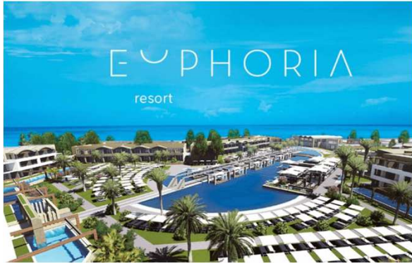
Euphoria Resort, Crete, Greece