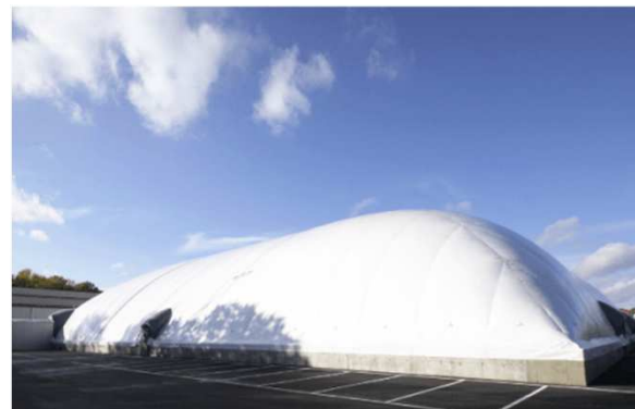
Smart Air Dome, Järvenpää, Finland