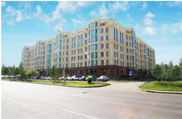
Apartment Building Europe Palace, Astana, Kazakhstan