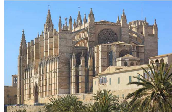
Mallorca cathedral, Mallorca, Spain